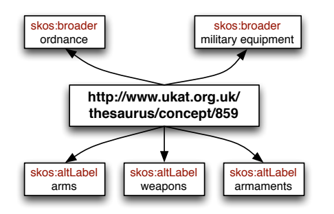
Figure 5: SKOS URI-based (Query) Expansion example