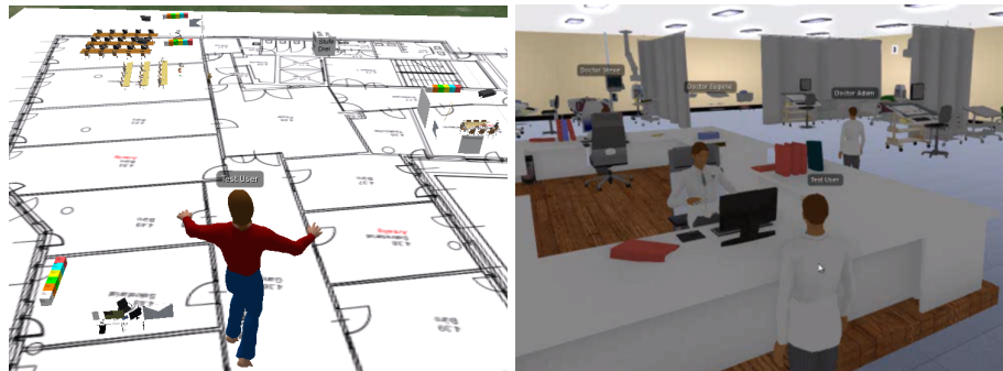
Fig. 2. Images from virtual worlds developed for the Vienna Computer Science (left image) and Dutch hospital (right image) case studies.

artefacts in the environment to support the extraction of relevant events for process mining. Detail is focused upon the items that are specifically used in processes. The more superfluous items, with regards to this simulation, are the walls and roofs of the buildings, as they do not play as strong a part in the process of priming people [9]. We argue logically that the objects of most relevant affordance should be presented at the highest level of detail as they have the most influence on the cognition of the user with respect to their process activities. We argue that the rest of the scene may be left in lower levels of detail, with a lowered effect on the tasks being elicited. As a corollary, we have adopted a common visualization approach of presenting our examples with floor plans and uploaded meshes from free sources (3D Sketchup Warehouse 5 ). Examples of the environment have been developed for our case studies and are shown below in Figure 2. We used office artefacts gained from the Google 3D SketchUp service, thus no real modelling was required for the office example. In the hospital version, the objects in the scene have been constructed by hand, but similarly, representational hospital objects can be found in the online Sketchup database. We emphasise that, in these use cases, low amounts of modelling were required in order to generate a useful virtual world.