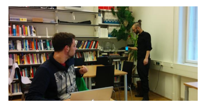
Figure 2. Triggering sounds of spatially distributed smartphones

From a creative perspective the musician appreciated the spatial distribution of sounds in the room [2]. This test also allowed the musician to get a feeling for the technical setup and its creative capabilities. This firstly prompted her decision to make an original composition instead of using an existing piece and secondly allowed her to brainstorm different ways to compose for a distributed smartphone setup. An open question after this first test was how to give the audience more agency beyond moving with their smartphones.