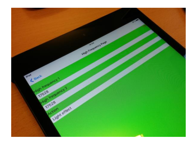
Figure 3. Second prototype version of the app displaying recognised control signals

app use distinct colors for each sample to make clear what is played back on each phone. We also added capabilities for an introductory message and to display text with each sample that is triggered. From a creative perspective we discussed that some sounds could be played on a normal sound system with only a part of the music coming from smartphones. To increase the diversity of sounds and to make the resulting soundscape more interesting we also introduced the use of weighted random to determine which sounds are played on a particular phone.