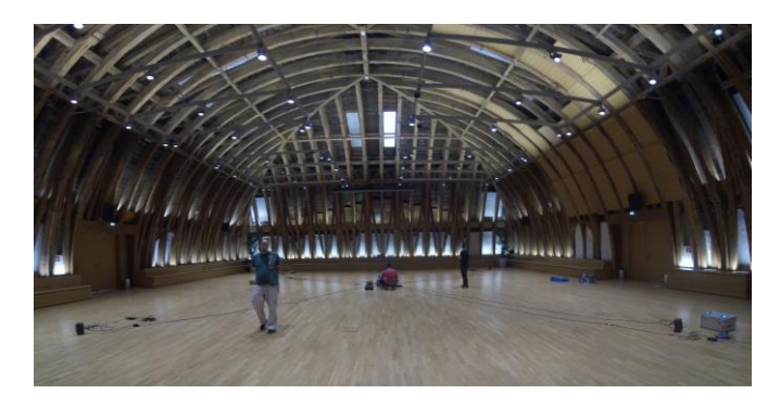
Figure 6. Center stage setting in the final location with four stations, one in each corner.

this setup was used. This was also the first time that the musician's composition adapted to the sound of mobile phones by using hi-pass filters and generally making use of the frequencies that work well with phones (e.g. bell sounds).