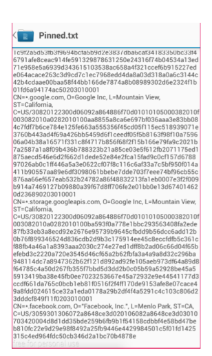
Fig. 2: Screenshot from the file that contains the public key pins and the hostnames

as an extension to the framework. As specified by the Cydia Substrate framework, after installation of a new module the phone has to be rebooted. From the point when the phone is booted, the public key of every certificate for every connection is automatically pinned. Figure 2 shows the pinned public keys.