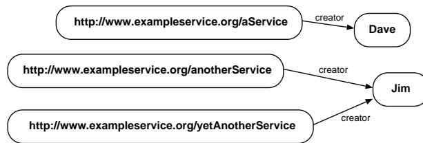
Figure 3. Example RDF Graph

Statement s1 "http://www.exampleservice.org/aService" \ "http://purl.org/dc/elements/1.1/creator" \ "Dave" Statement s2 "http://www.exampleservice.org/anotherService" \ "http://purl.org/dc/elements/1.1/creator" \ "Jim" Statement s3 "http://www.exampleservice.org/yetAnotherService" \ "http://purl.org/dc/elements/1.1/creator" \ "Jim" rdfModel add s1 rdfModel add s2 rdfModel add s3