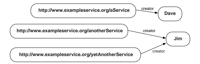
Figure 3. Example RDF Graph