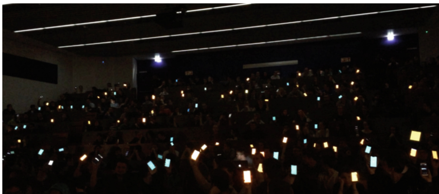
Fig. 2. A test of the system with students during a lecture.

To demo the setup at the conference little infrastructure and no dedicated performance space is needed. The technical and creative aspects can be demoed in an ado setting where visitors pass by a small performance hub and either just listen to the soundscape or take part using a provided or their own smartphone. The authors will provide a laptop and a minimum of ten smartphones. The app also is available for download for free for both Android and iOS platforms. The authors will also bring speakers, which